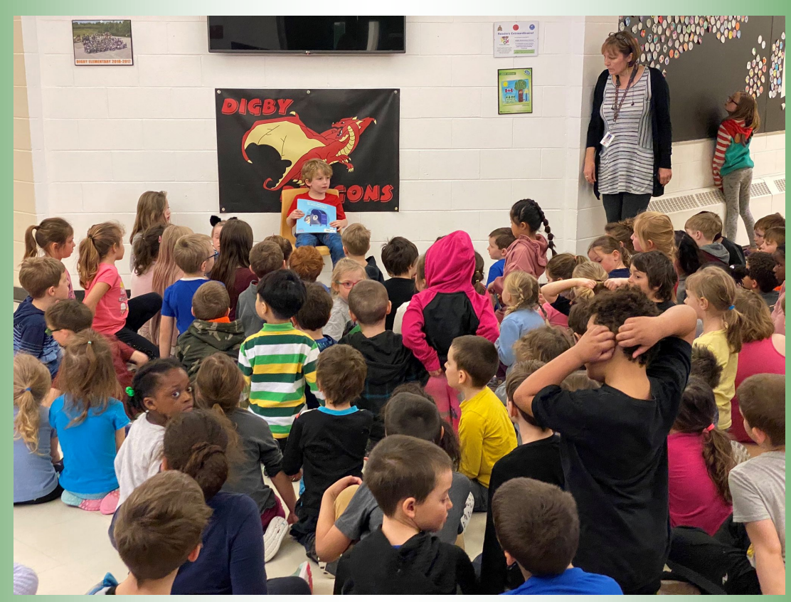
It has been amazing to see so many of our student leaders sharing their love of reading at recess. On March 6, four DES primary students showed off their confidence as they shared their reading skills with all who wished to listen!