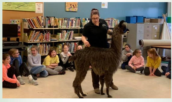
Clark's Harbour had some sweet, furry visitors from Nashwaak Valley Farm!