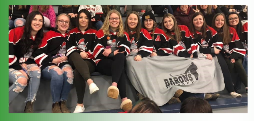
Students from BMHS cheer on their Barrington Barons!