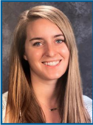
Danielle LeBlanc Teacher Award