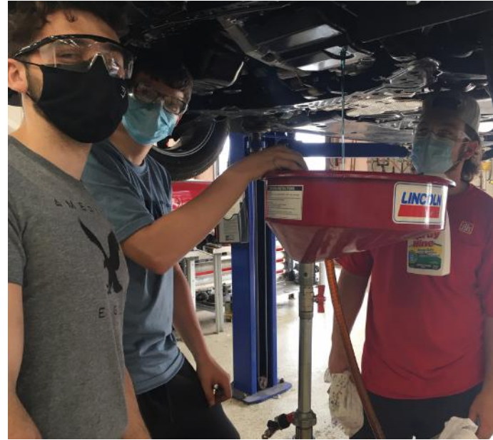
Participants of this summer's co-op placements in Test Drive & Building Futures for Youth.

- 5 TCRCE students are participating in the Test Drive Program and after safety training at NSCC, they will explore a career in motor power trades for 5 weeks this summer. While on the job, they too will earn 3 high school Co-op credits as well as 300 apprenticeship hours.