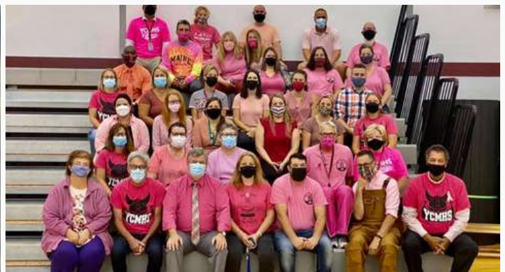
Staff at Yarmouth Consolidated Memorial High School take a Stand Against Bullying and show their support for Pink Shirt Day on September 9th (pictured above).