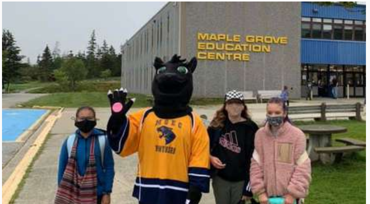
Maple Grove Education Centre students meet the school's new mascot, Maple! (Pictured above).