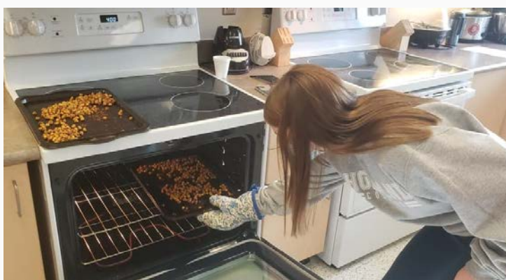
Food & Nutrition 8 students at Shelburne Regional High School roast chickpeas in the food lab (pictured above).