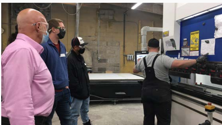
DRHS Transportation Trades 11 students receive a tour of Tri-Star Industries and learn they make much more than ambulances! (Pictured above).