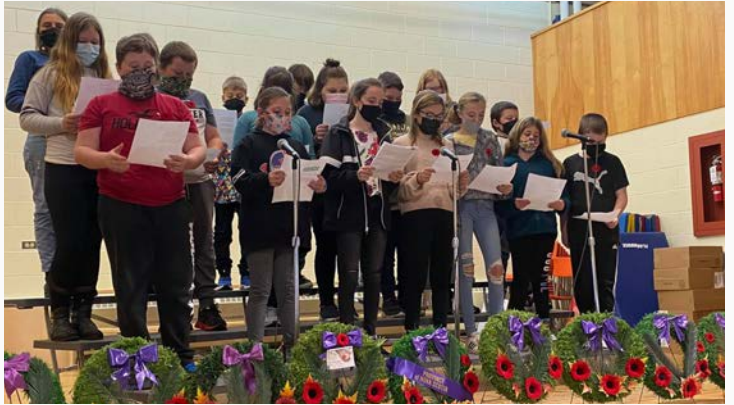
Students at Evelyn Richardson Memorial Elementary School participate in a Remembrance Day ceremony (pictured above).