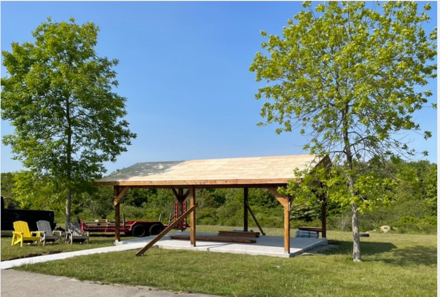
Pictured above: a new outdoor learning space was recently constructed at Drumlin Heights Consolidated School.