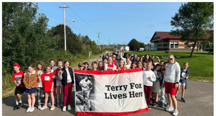
Students at Meadowfields Community School participate in the annual Terry Fox Walk (pictured above).