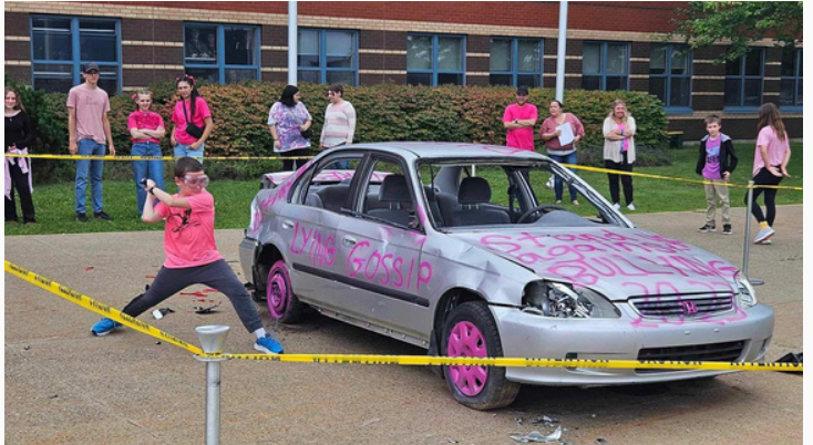
A student at Digby Regional High School takes a turn at smashing away the hate for Stand Up Against Bullying Day on September 14, 2023. (pictured above).