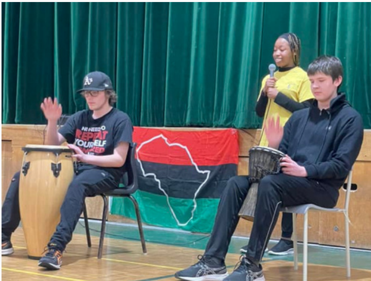
Maritime Centre of African Dance visited Lockport Elementary and Lockport Regional High School (above).