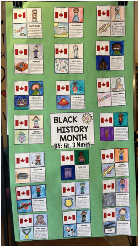
Grade three students at Port Maitland Consolidated Elementary School made a construction paper quilt with the information they learned about influential people of African Descent.