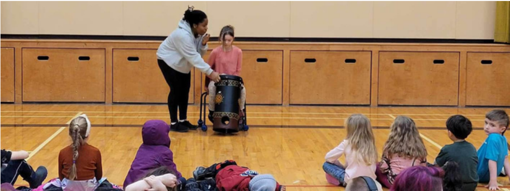
Carleton Consolidated School welcomed students and staff from Port Maitland School and together, the group watched an African Dance and Drumming presentation.