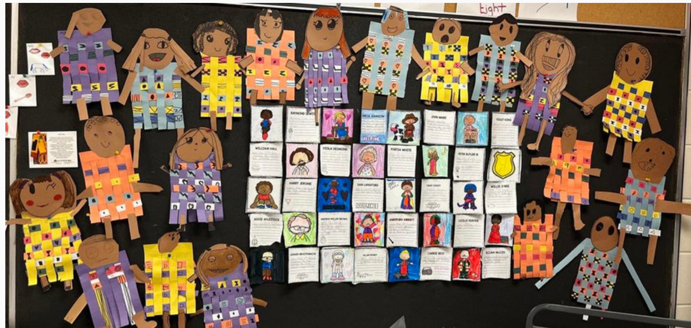
At Hillcrest Academy, the grade twos researched influential African Canadians and presented their research to the class. Students also learned about the Kente cloth and created their own, by weaving paper (pictured left, above).