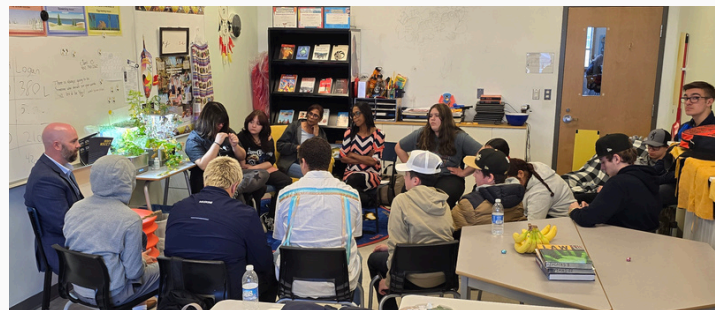
Students and staff participate in a talking circle.

In 2022, several Mi'kmaw students from our region participated in the Two-Eyed Seeing Project, a collaborative boat-building initiative hosted in Halifax through a partnership with Mount Saint Vincent University and the Maritime Museum of the Atlantic. This meaningful project allowed students to honour their Mi'kmaw heritage while gaining valuable hands-on skills and strengthening their connection to both Indigenous and Western knowledge systems.