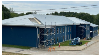
Metal roof at Carleton.