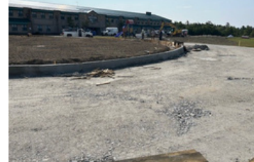
Student drop off at Hillcrest.